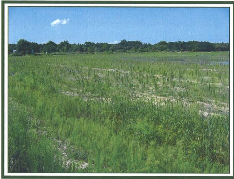
Photo Station 3-Looking South-Southwest